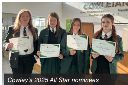
Cowley's 2025 All Star nominees

This week, we began planning for the St Helens Secondary Schools All Stars Awards. This is a wonderful evening celebrating the achievements of students across the borough. Last year, four Cowley students were shortlisted, with one going on to win in their category.