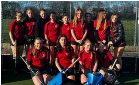
Our U16 Hockey team drew 2-2 in the Merseyside Hockey Tournament against Liverpool College.