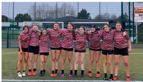
Our Year 9 and Year 10 Girls' Rugby team played impeccably at the St Helens Festival earlier this week.