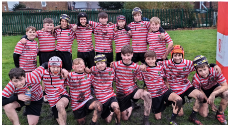
The Year 8 Rugby team played fantastically against Wade Deacon in the North West Counties competition.