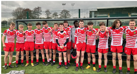
The Senior Rugby team gave the performance of the season against a strong Warrington Wolves College.