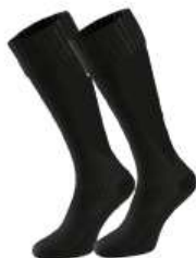
Socks Plain, black long socks.