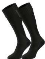
Socks Plain, black long socks.