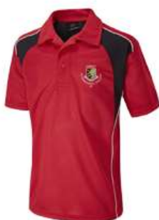
Polo shirt Red with/without Cowley emblem.