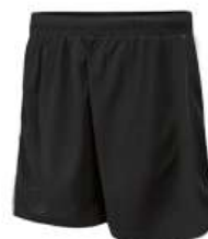
Shorts Plain black.