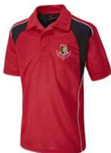
Polo shirt Red with/without Cowley emblem.