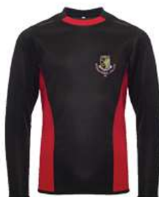
Rugby top Black with reversible red flash with/without Cowley emblem.