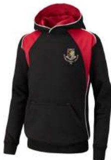
Hoodie Black with/without Cowley emblem.